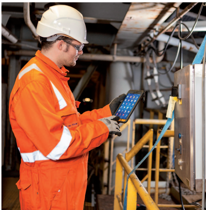
Equipment data and state is directly available, creating a better-informed workforce

eVision's mobile apps take various key work processes, and put these in your pocket. Listening to industry needs means that new apps are frequently being developed, ensuring continued support for your daily maintenance.