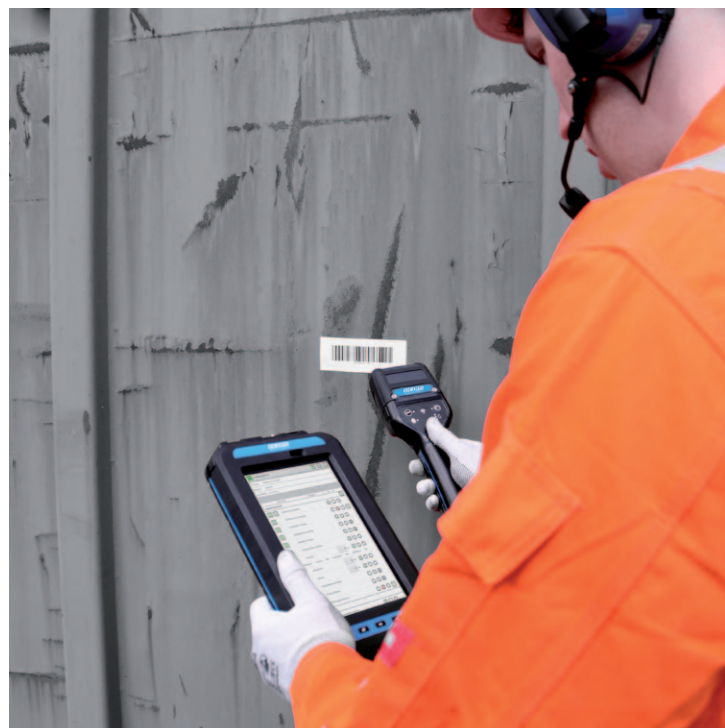
Safety and accuracy improvements through integrated RFID and barcode scanning